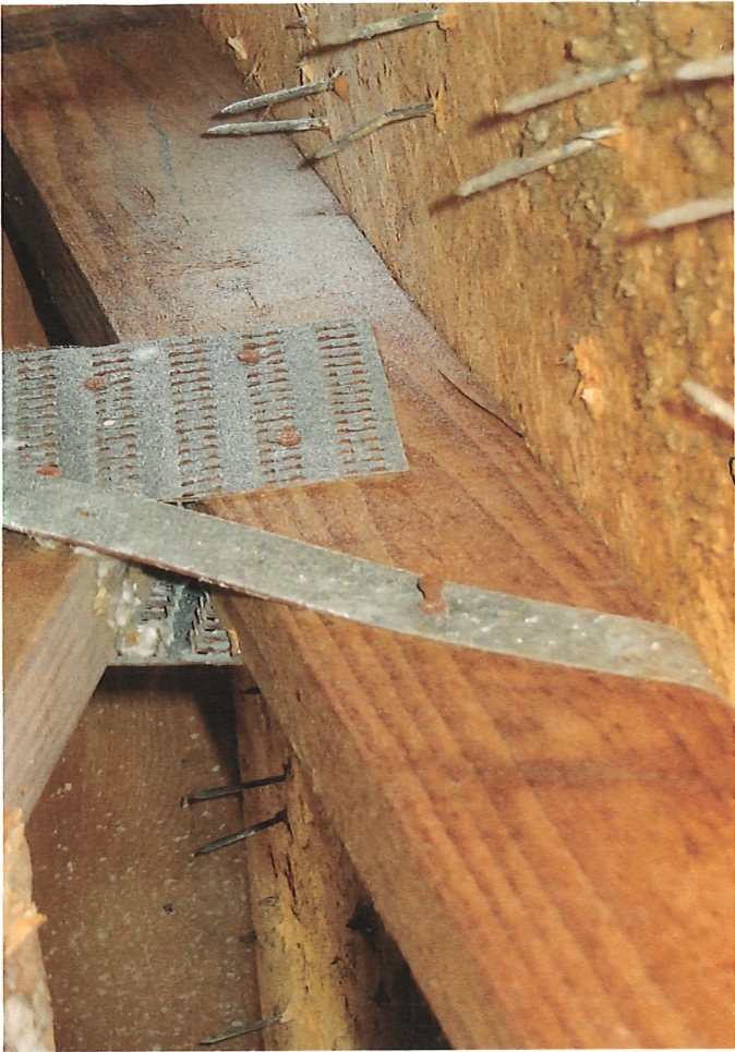
2 nails only